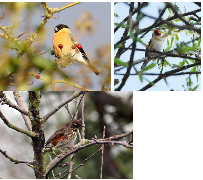
Note: this is a goldfinch, not a goldcrest!